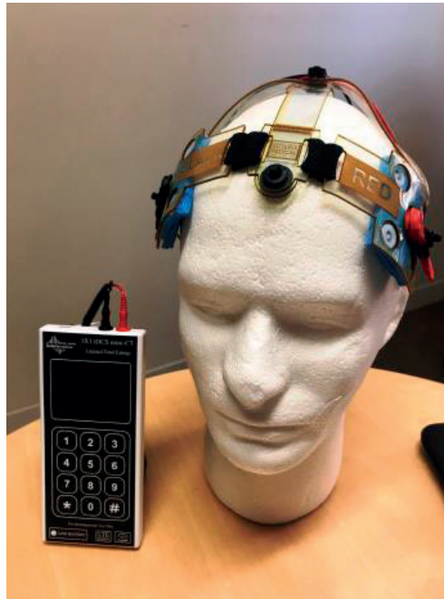
Figure 3. Example of transcranial direct current stimulator (tDCS) setup; mini-clinical trials (mini-CT) Unit, Soterix Medical ® .

only a subliminal neural hyperpolarization (under the cathode) or depolarization (under the anode), reducing/increasing in turns the responsiveness of the target neurons to the on-going afferent brain activity. Importantly, when combined with a second input, tDCS could results in powerful induction of LTP or LTD like phenomena. The mechanisms underlying this potential synergistic effect are not fully known, but they may rely on associative plasticity. It is known that task-specific training can induce task-specific neuronal changes based on use-dependent plasticity phenomena [20]. Therefore, the combination of behavioral tasks and tDCS may offer significant chances to achieve neuroplastic changes. The task-dependency of tDCS may influence the inter-individual variability of behavioral or neurophysiologic outcome observed after stimulation [21].